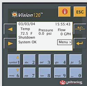
HR-Series PLC Display