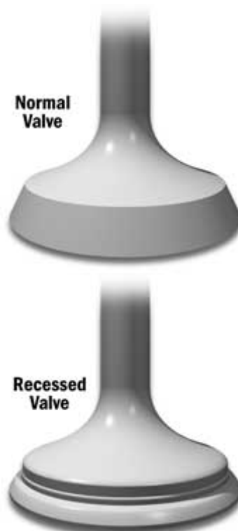
Figure 1. Typical Valve Recession in a Natural Gas Engine

Valve recession is the premature wearing of the valve seat into the cylinder head. The sulfated ash residue helps to prevent premature valve recession by “cushioning” the valve seat area (Figure 1).