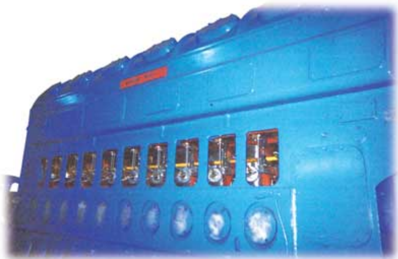
Figure 5. The Fairbanks Morse Vertically Opposed Piston, Lean Burn, Two-cycle Engine

Manufactured in Beloit, Wis., Fairbanks Morse vertically opposed piston, lean burn, two-cycle engines (Figure 5) typically consume one gallon of oil, per cylinder, per day when operating at their rated full load.