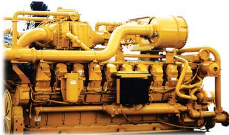
Figure 4. The Caterpillar 3520 Lean Burn Natural Gas Engine

Caterpillar recommends oil drains at 750 hours, or at an appropriate interval based on a regularly scheduled oil analysis program. Caterpillar engine oil specifications call for oils with sulfated ash levels not to exceed 0.45 percent (wt.) with a BN of 4.8.