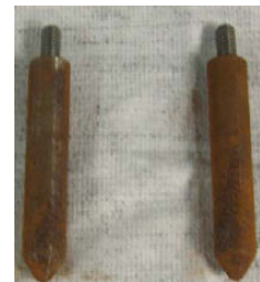
" Fail "